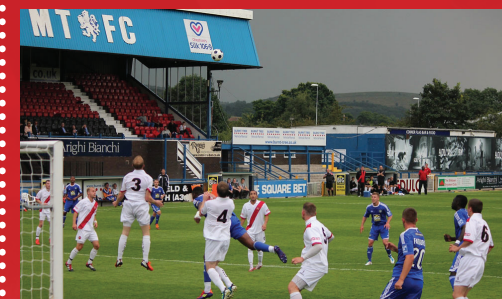
Macclesfield v FC at Moss Rose in August 2012

• As football fans, it will be a situation we'll be following closely over the coming weeks and I'm sure everyone at FC United will wish the club all the best in their current, and possibly ultimate, fight for survival.