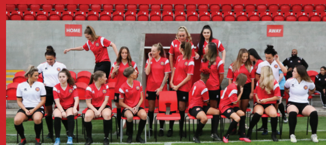
A FCUMW squad poster will appear in the next edition

The side will be keen to make up for lost time after being denied promotion last time around, with the Reds boss stating that: "The league is everything to the team this season. We can't wait to start and get things going. "We know it's going to be far from a straight forward season with what's happening in the world, so we are preparing to the best of our capabilities to deal with anything that is thrown at us."