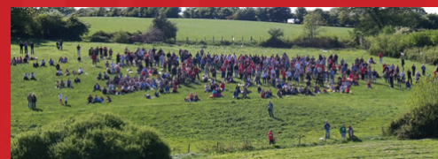
All answers found at the foot of the Stats Entertainment page